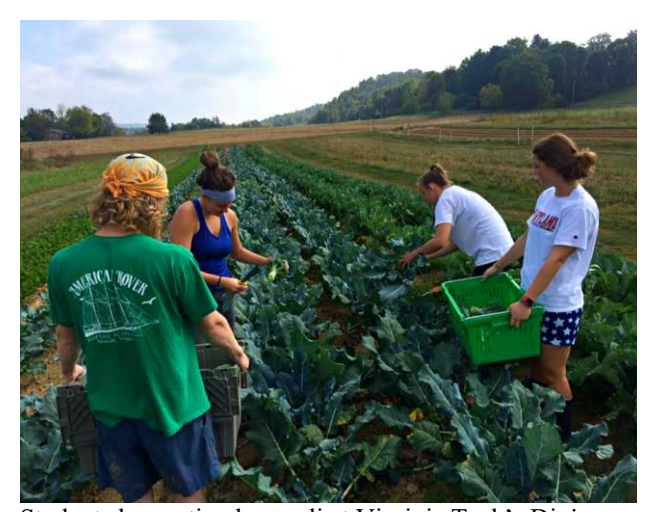
Students harvesting broccoli at Virginia Tech's Dining Services acreage at Kentland farm.

Through a research study conducted through Harvard's Food Law and Policy Clinic, the contributors highlight the importance of how universities and colleges should be capitalizing on the increasing demand of buying and eating local. They recommend that state colleges and universities gain a "competitive edge" by being more transparent with their food procurement practices. This in turn could raise the colleges' and universities' public ranking and would therefore give themselves a competitive edge in student recruitment. Collaborations, in which institutions grow a part of their produce at campus facilities, not only provide a fresh source of local foods for the dining hall, but also